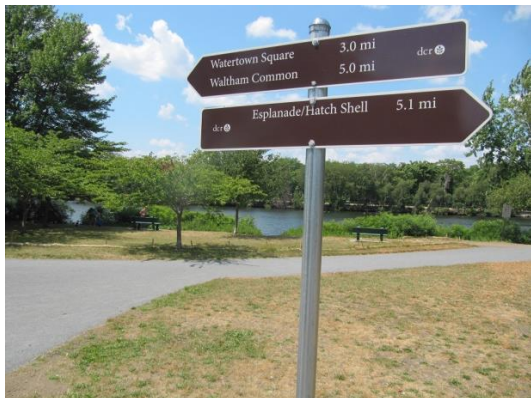
Wayfinding / Direction and Distance